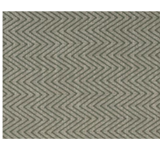
OLD GREEN 8335/01