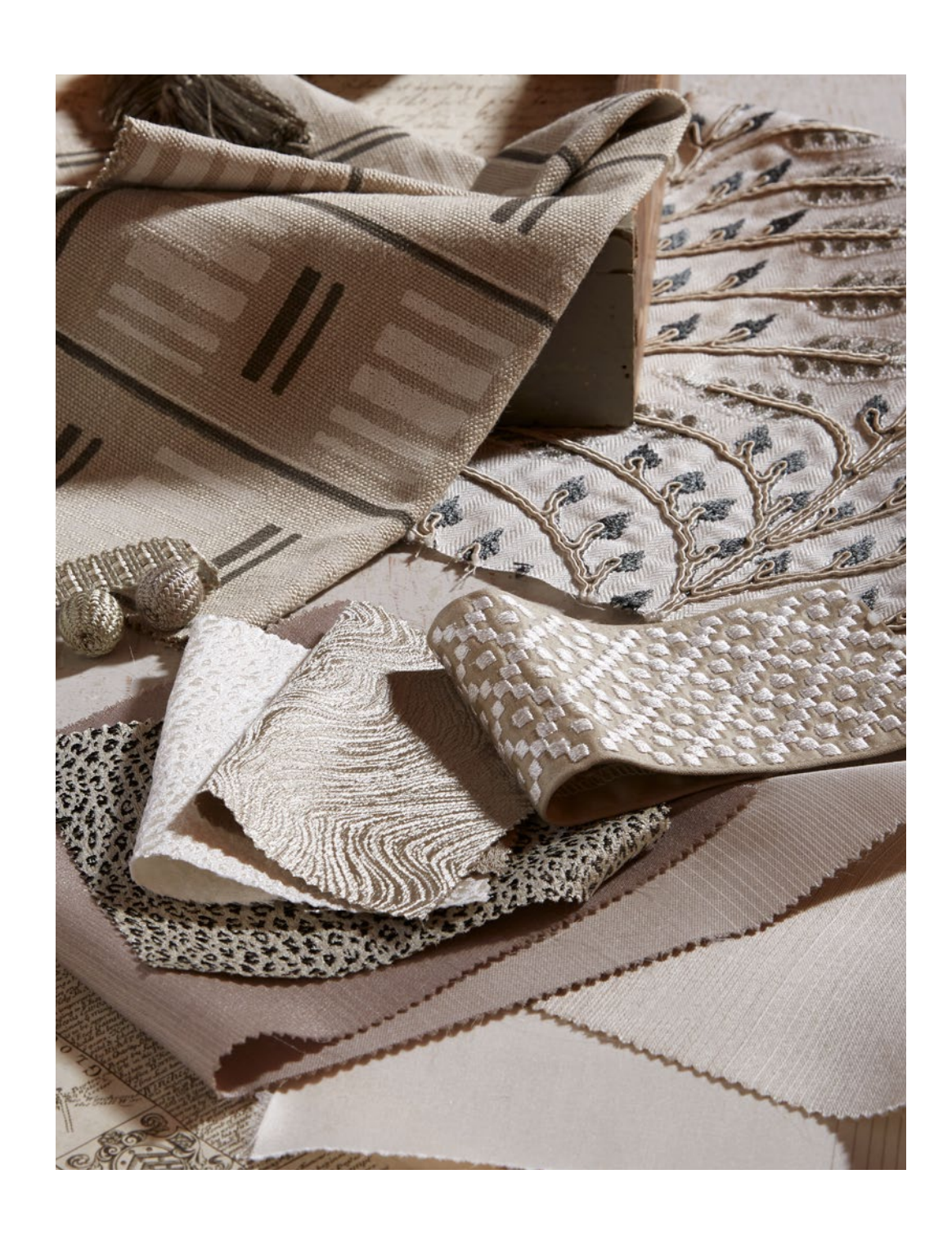
Right Curtain: Horizon, Mushroom. Sofa: Chelsea, Mineral. Trim: Burford Braid, Mineral. Cushions from back: Strata, Sandstone. Chelsea, Ivory. Trim: Burford Braid, Mineral. Footstool: Leopard, Ivory. Trim: Burford Braid, Mineral. Cushion: Leopard, Savannah. Lampshade: Regal Silk, Oyster.