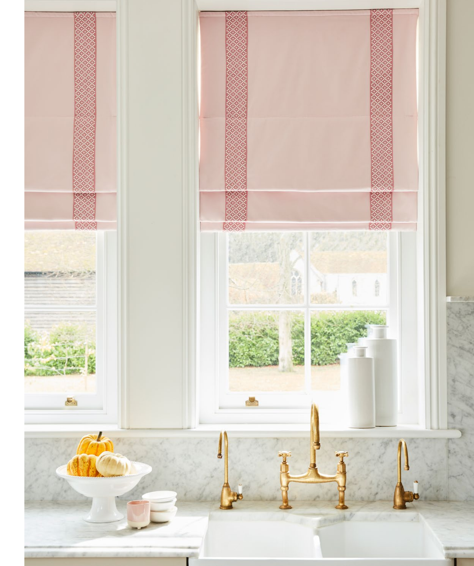
Right Blinds: Chelsea, Petal. Trim: Burford Braid, Lupine.